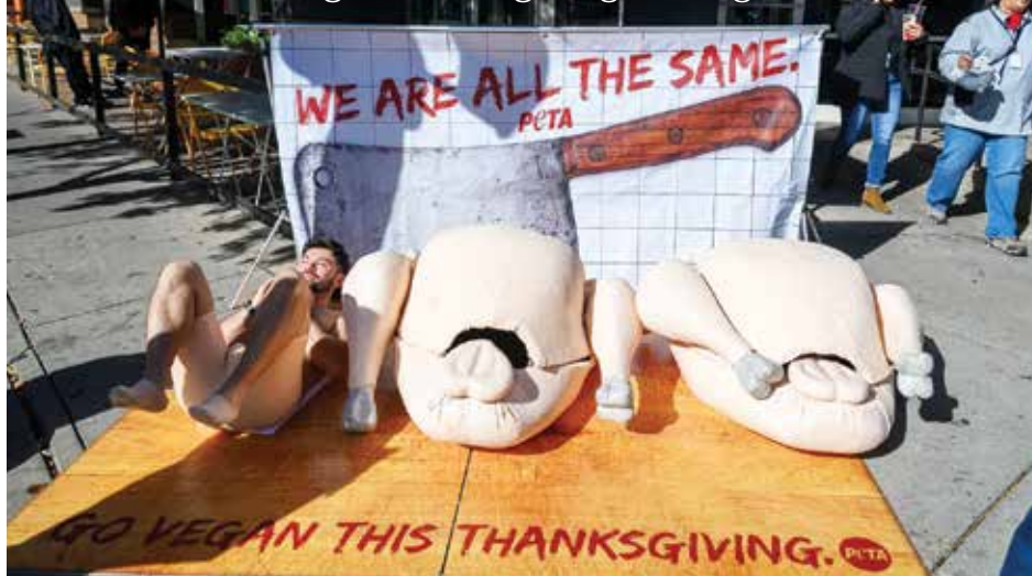
A nearly naked PETA supporter lies next to two giant “turkey carcasses” on a cutting board outside 505 Central Food Hall last week to urge onlookers to give birds a break this Thanksgiving.

PETA demonstration puts humans on the menu to promote vegan Thanksgiving cooking